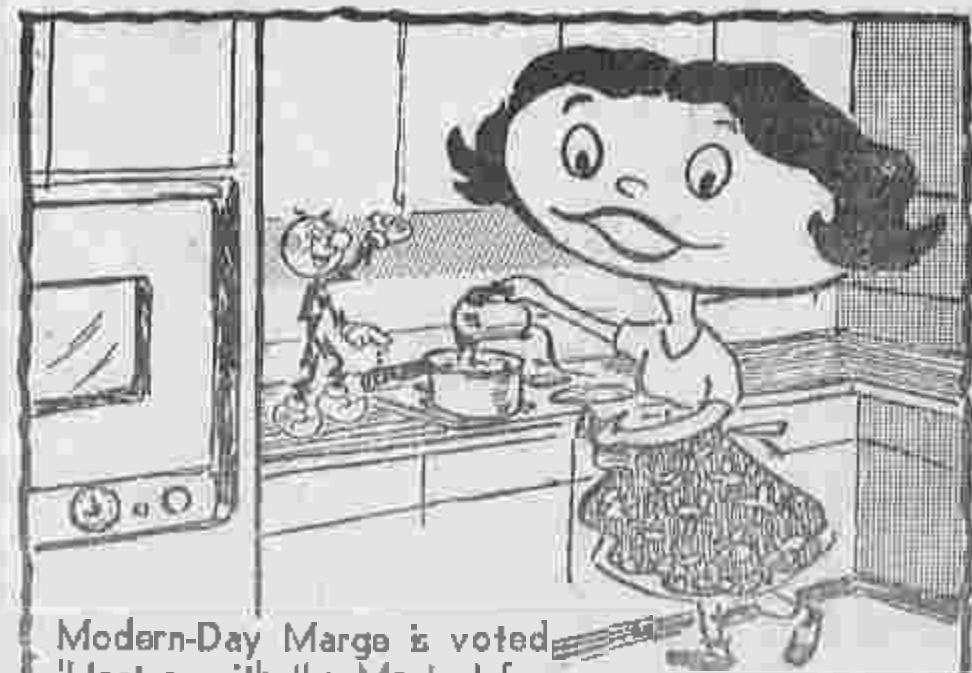
Modern-Day Marge is voted 'Hostess with the Mostes' for her pastries and party favors prepared with the automatic electric stove.

It was a clean sweep for the Bl-county entries, with Harrington placing third behind Odessa on a 54-37 win over Republic. All three Bl-county teams and Republic will play in the state B-tourney in Spokane, starting today.