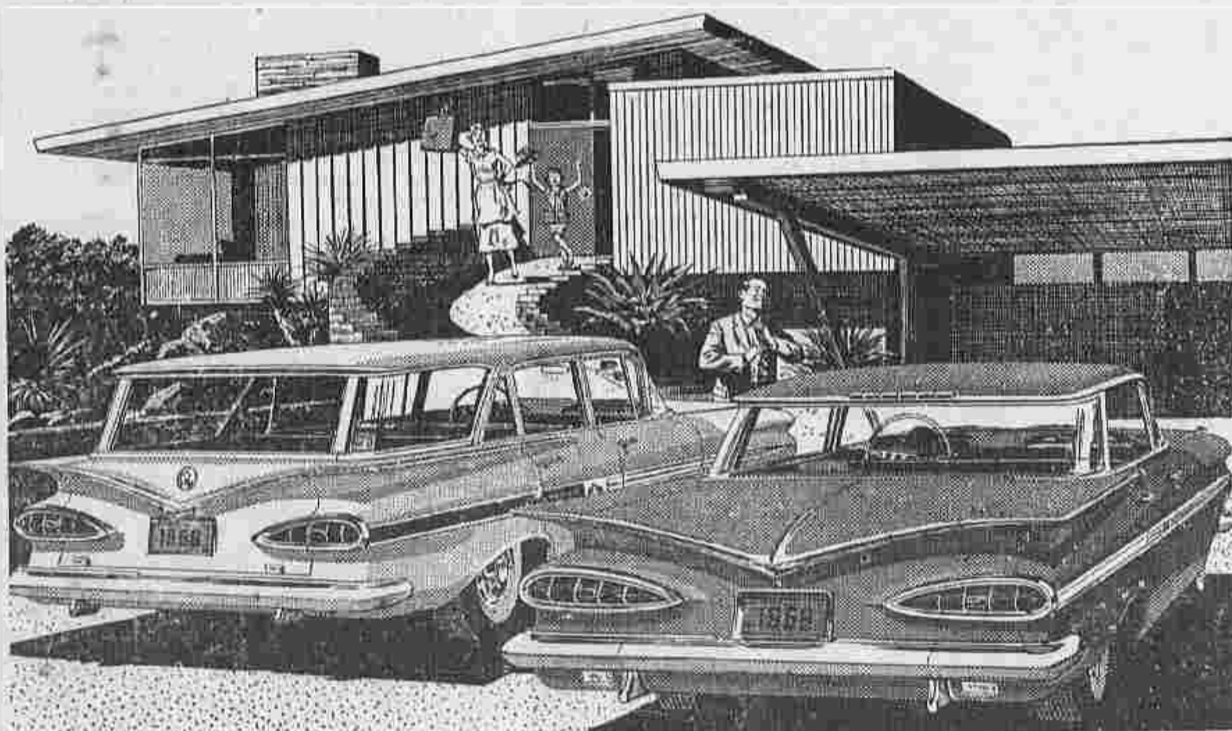
The 6-passenger Nomad and the Impala 4-Door Sport Sedan.

now—see the wider selection of models at your local authorized Chevrolet dealer's!