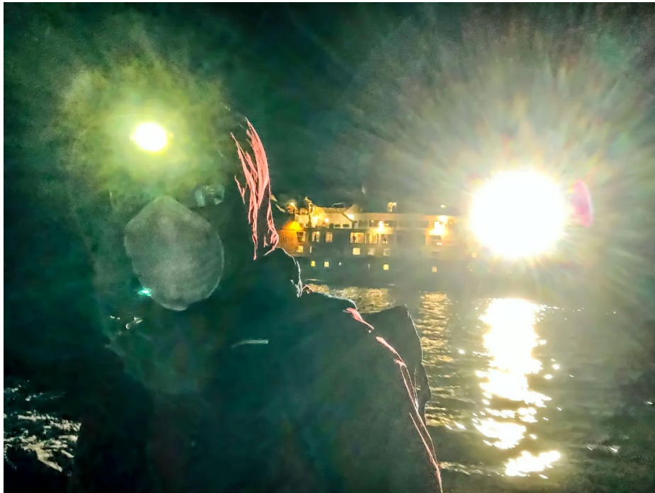
Image captured by Ross McDonald, expedition photographer. That's me, masked with a headlamp on the zodiac, heading to the ferry with the Silver Explorer in background.

The release of healthy staff and guests from the Silver Explorer was no doubt done with full cooperation and guidance of the Chilean government. The police escort to the airfield was most likely for our own protection from protesting mobs, hence the secrecy in the dark of night and the request to not broadcast the plan on social media at the time.