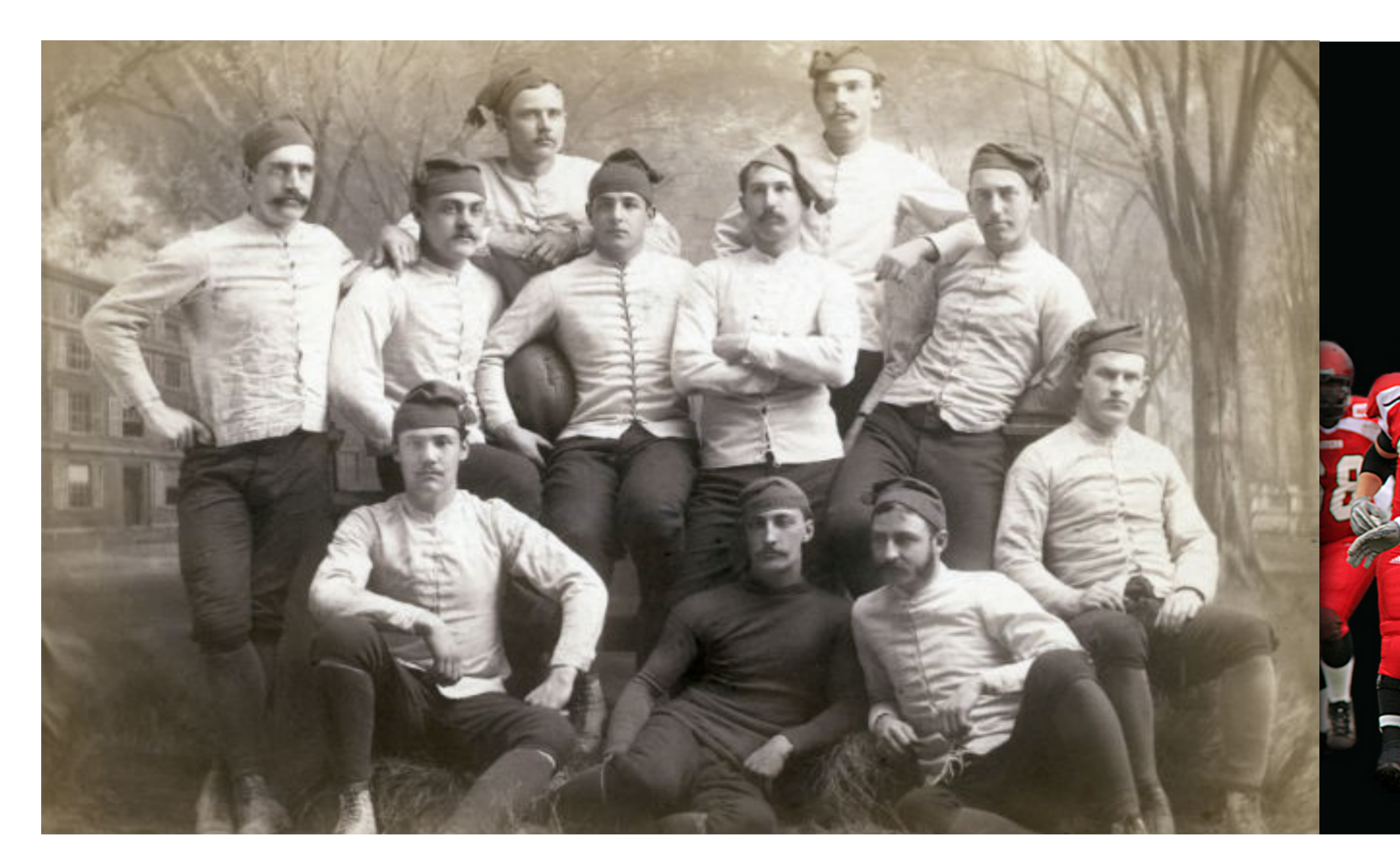
Then: Yale University, late 19<sup>th</sup> century