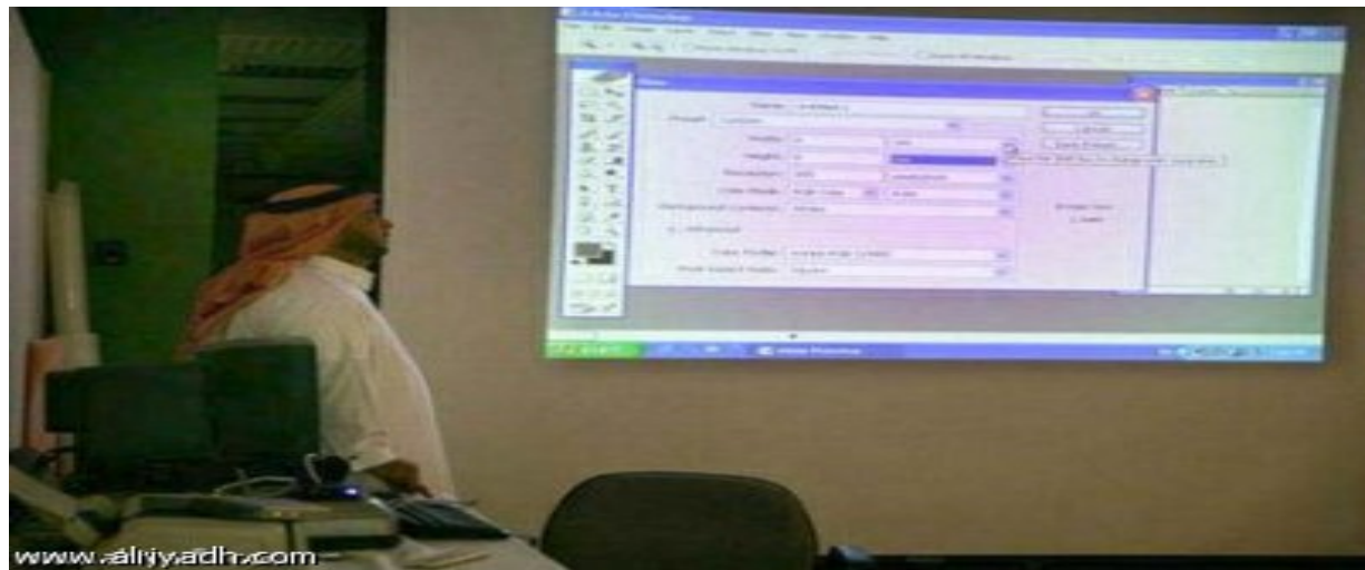
Figure4. Media Use in the English Class in Saudi Arabia

In Figure 4, we see a Saudi English teacher who is showing his students how to use the class website to submit their assignments.